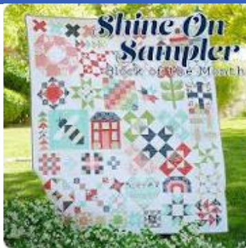
Shine On Sampler BOM