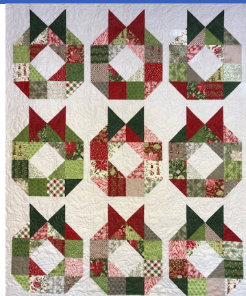
Deck the Halls

This block of the month program includes over 22.5 yards of Shine On fabric by Bonnie & Camille for Moda fabrics. It also includes