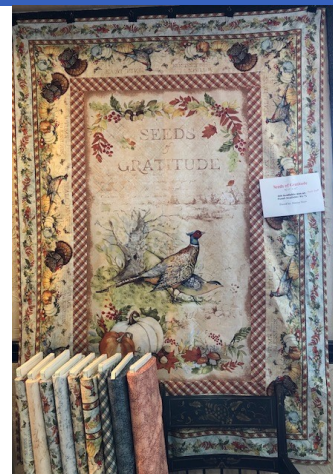
Seeds of Gratitude

Create this beautiful, fall wall hanging using Prints designed by Susan Winget for Wilmington Fabrics. Panel, border stripe and coordinating fabrics