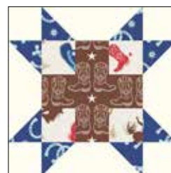
Plus Star Block

Sew a Unit G to the top and bottom of Unit F to create the Plus Star Block. Repeat to create 4 assorted print Plus Star Blocks.