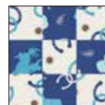
Nine Patch Center Unit

Refer to the block diagram for placement of 5 assorted print 3 \frac{1}{2} " squares and 4 different assorted print 3 \frac{1}{2} " squares. Sew the squares together in 3 rows of 3 squares to create the Nine-Patch Center Unit.