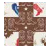
Plus Center Unit

Sew a Unit D to the top and bottom of a brown boots 3\frac{1}{2} " x 9\frac{1}{2} " rectangle to create the Plus Center Unit.