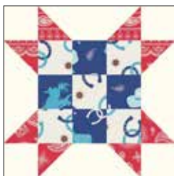
Nine-Patch Star Block

Sew a Unit C to the top and bottom of Unit B to create the Nine-Patch Star Block. Repeat to create 12 Nine-Patch Star Blocks.