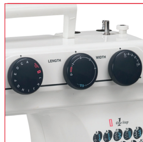
Stitch Selection Dials