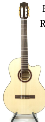
Kremona Rosa Luna CW