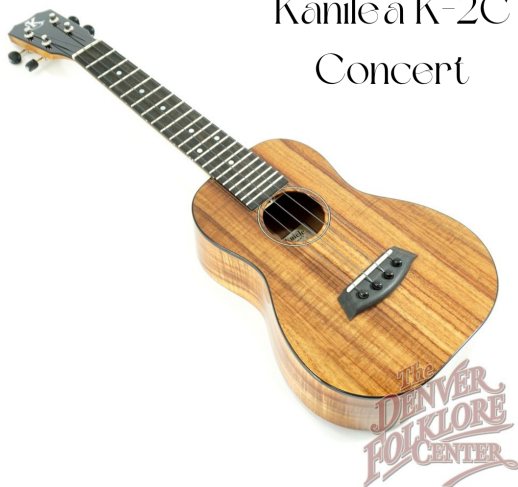
Kanile'a K-2C Concert