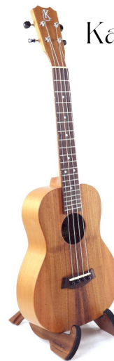
Kanile'a Oha Tenor