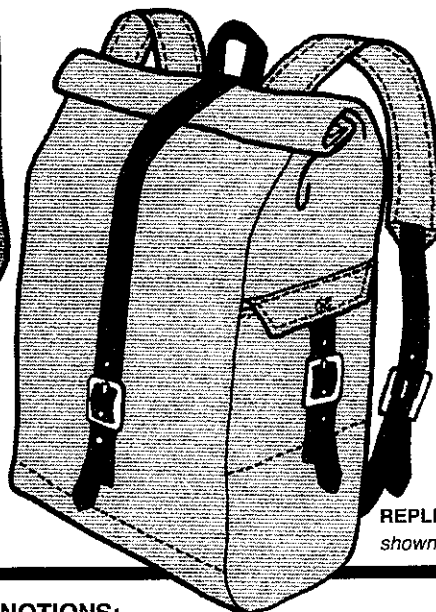
REPLICA BAG shown with rolled top