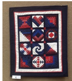
2nd place Valerie Ineichen