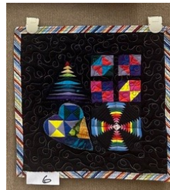
Participation Sasha Anzures