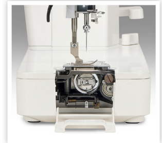
SIDE-LOADING BOBBIN FOR EASY ACCESS