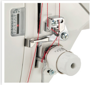
HEAVY-WEIGHT THREAD GUIDES