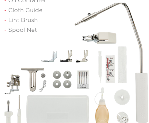
Included Accessories Shown