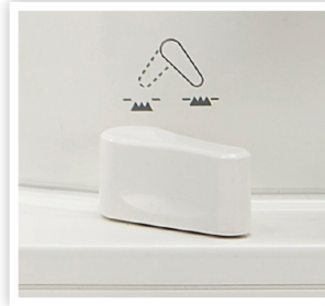
FEED DOG DROP LEVER