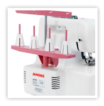
4 SPOOL PINS WITH EASY TO FOLLOW THREAD CHART