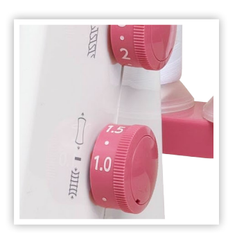
PRECISE FABRIC CONTROL WITH DIFFERENTIAL FEED