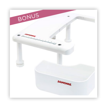
EXTENSION TABLE AND WASTE CHIP BOX