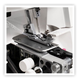
ADJUSTABLE CUTTING WIDTH