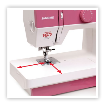
105.4 mm (LEFT) x 111.8 mm (IN FRONT) OF THE NEEDLE (4.15 x 4.4")