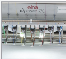
INCLUDES 7 NEEDLE HEADS

Power Through Embroidery! The Elna eXpressive 970 is the perfect tool to help you conquer your next embroidery project. This innovative machine is built to work with embroidery formats used by industry professionals such as .JEF+, .JEF and .dst. With 50 built-in embroidery designs and 10 fonts for monogramming, a USB port to easily import designs and a maximum speed of 800 SPM, the possibilities are endless. All embroidery operations are noticeably faster and smoother on the EL970. You will be impressed with your project's professional-finished results.