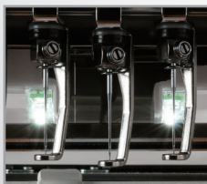
6 WHITE LED LIGHTS