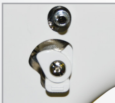
INDEPENDENT BOBBIN WINDING MOTOR