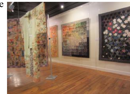
Wishes Through Our Hands: Japanese Quilts

Fourth quarter exhibit: Wishes Through Our Hands: Japanese Quilts . The quilt styles ranged from delicate silk appliques to bolder pieces featuring sashiko stitching on indigo cottons. We were very fortunate to have had the opportunity to show this exhibit, which is a biennial event curated by the La Conner Quilt Museum in Washington.