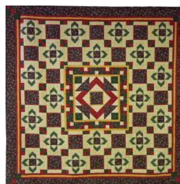
Evening Floral Serenade