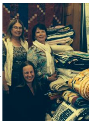
Cover Colorado quilts at Lyons Quilting

RMQM wrapped up the Cover Colorado quilt drive in 2014. The number of quilts donated by RMQM members and friends greatly exceeded our original expectations, and we were reminded to never underestimate the generosity quilters! With help from individual members, the staff of Lyons Quilting, and the outreach organization Colorado Spirit, RMQM distributed more than 600 quilts to those affected by the September 2013 flooding.