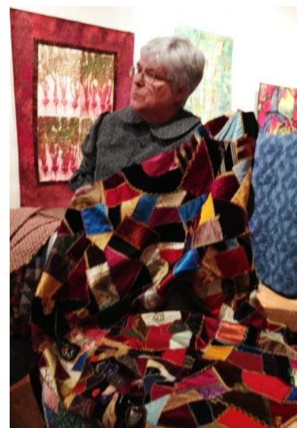
Costumed docent presenting Voices from the Past trunk show

RMQM is proud to host Sunday afternoon book signing events for new books by Sandra Dallas. In November, Sandra signed copies of her 2014 release A Quilt for Christmas . Longtime museum supporter Sandra Dallas also hosted a successful house tour and tea at her restored Victorian home in Georgetown, Colorado to benefit RMQM.