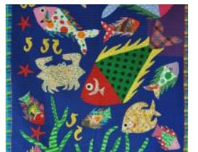
Caohagen Island quilt