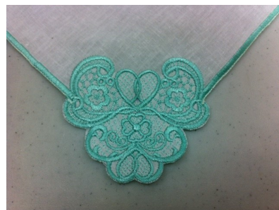
Embroidered Corner Hankie

We will share & demo amazing embroidery tips & techniques throughout our 2-day event. Explore Baby Lock Embroidery machines & software products! Special Pricing on all items & Baby Lock Embroidery Machines.