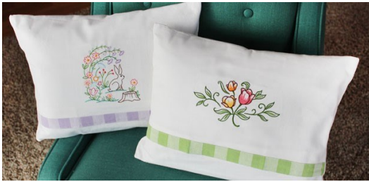
Embellished Tea Towel

See how easy to operate and control an embroidery machine with hooping, marking & learning embroidery placement tips. Learn to embroider with specialty threads such as metallic & embroidery floss. Want to do hats? It's easy with the right equipment & hoop. Embroidery for toddlers or children? Our Embroidery Specialist will take you on a fun filled journey through demos and hands-on projects using state of the art embroidery machines. Explore creative monogram styles & trendy layouts with embroidery software. Sign up Today and reserve seat, the class is held in a round robin style to enhance your learning experience. Be sure to check supply list. Each student will complete 4 embroidery projects.