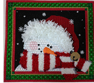
Shy Snowman by Pepperberry Designs 9.5" x 8.5" • 18 Mesh

To sign-up and for details, call the shop 937-298-5776