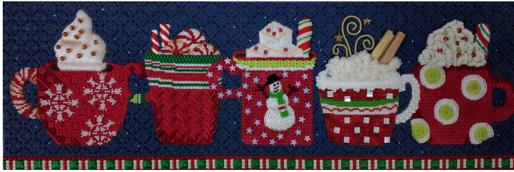
Cocoa Cups by Melissa Shirley 18" x 6" • 18 Mesh

To sign-up and for details, call the shop 937-298-5776