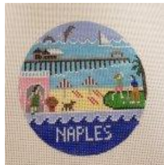
Naples 4" Round $77 Doolittle Stitchery Designs 18 mesh, 8 x 8 canvas