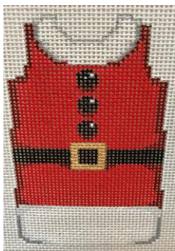
Santa Mini Shift $44 Two Sisters Designs 18 ct, 7 x 9 canvas