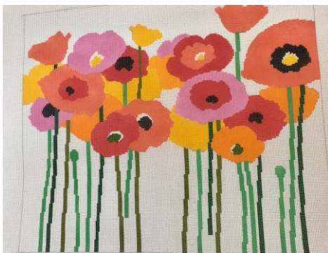
Poppies $138 A Sttch In Time Designs 18 mesh, 15 x 17 canvas