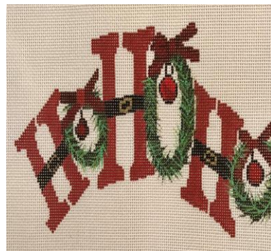
HO-HO-HO w/ Wreaths $46 The Point of It All Designs 13 mesh, 10 x 15 canvas