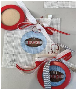
Bucks Football w/ Frame $48 Beth Gantz Designs 18 mesh, 6.5 x 6.5 canvas