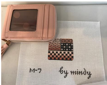
Peach Credit Card holder w/ Canvas $80 Mindy Needlepoint Designs 18 mesh, 6 x 7 canvas