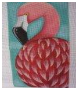
Flamingo $83 The Meredith Collection Designs 18 ct, 16 x 10 canvas