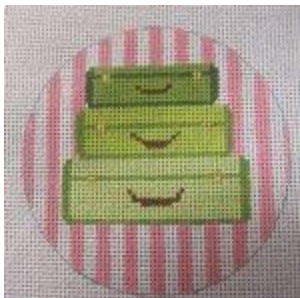
Luggage Tag $23 Original Louise's Design 18 ct, 5 x 5 canvas