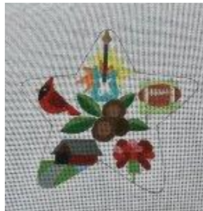
Ohio Star $63 Raymond Crawford Designs 18 mesh, 10 x 10 canvas