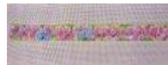
Floral Belt $161 Amy Lewandowski Designs 18 ct, 42 x 5 canvas