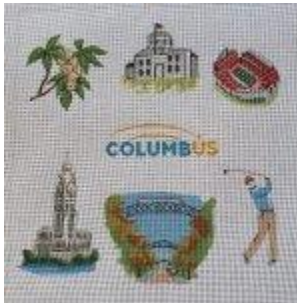
Columbus Pillow $115 An Original Louise's Design 18 ct, 15 x 5 canvas