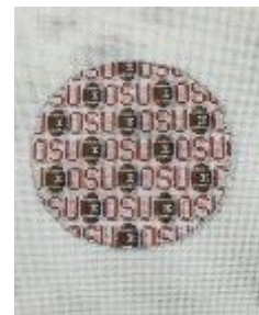
OSU Football Round $40 Beth Gantz Designs 18 ct, 7.5 x 7.5 canvas