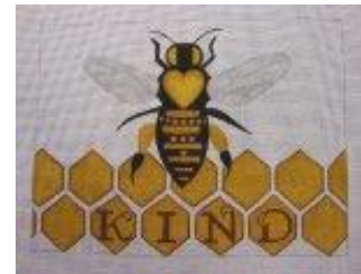
Bee Kind $112 Oasis Designs 13 ct, 15 x 12 canvas