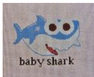
Baby Shark $59 Chris Lewis Designs 18ct, 10 x 8 canvas