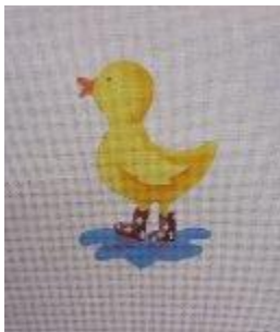
Rubber Ducky in a Puddle $48 The Meredith Collection Designs 13 ct, 9 x 7 canvas