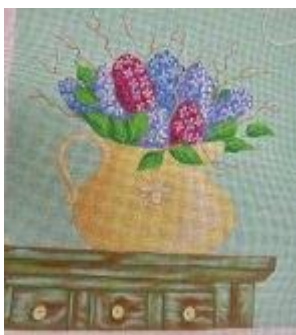
Lilac Flower Pot with SG $165 Valerie Needlepoint Gallery 18 ct, 14 x 14 canvas