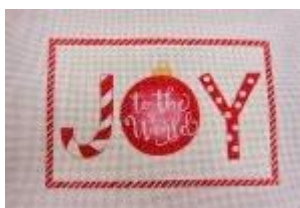
Joy To The World $55 And More Needlepoint Designs 18 mesh, 9 x 12 canvas