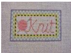
Knit $28 Kathy Schenkel Designs 18 mesh, 5 x 6 canvas