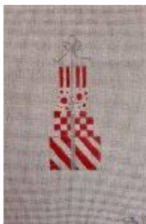
Stacked Preents $35 BB Needlepoint Designs 18 ct, 5 x 9 canvas