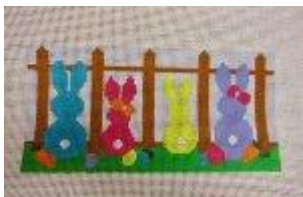
Bunny Butts with SG $88 Vallerie Needlepoint Gallery 13 mesh, 8 x 12 canvas & SG