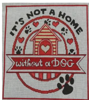
It's Not a Home...$67 Strictly Chrstmeas Designs 18 mesh, 12 x 12 canvas