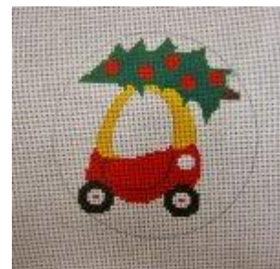
Little Tykes with SG $63 Valerie Needlepoint Gallery 18 mesh, 8 x 8 canvas