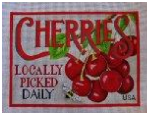
Cherries – Locally Picked $182

Raymond Crawford Designs. Hand-painted on 18 mesh. Total canvas size is 10 x 11.