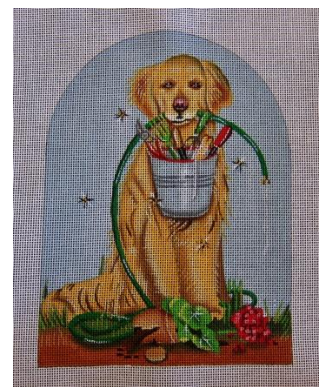
Golden Gardener $125

Melissa Shirley Designs. Hand-painted on 13 mesh. Total canvas size is 13 x 16.