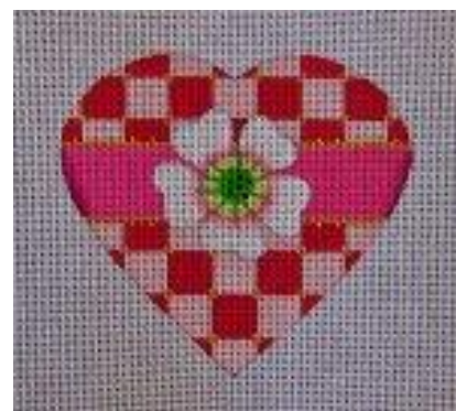
Red and Pink Checkerboard Heart $62

All About Stitching Designs. Hand-painted on 13 mesh. Total canvas size is 15 x 20.