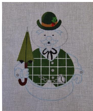
Plaid Snowman $69

Raymond Crawford Designs. Hand-painted on 18 mesh. Total canvas size is 10 x 11.