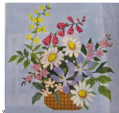
English Wildflower Basket w/sg. $180

Melissa Shirley Designs. Hand-painted on 18 mesh. Total canvas size is 9 x 9.