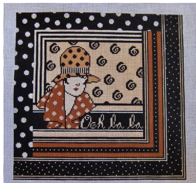
Ooh La La $156

Melissa Shirley Designs. Hand-painted on 18 mesh. Total canvas size is 11 x 13