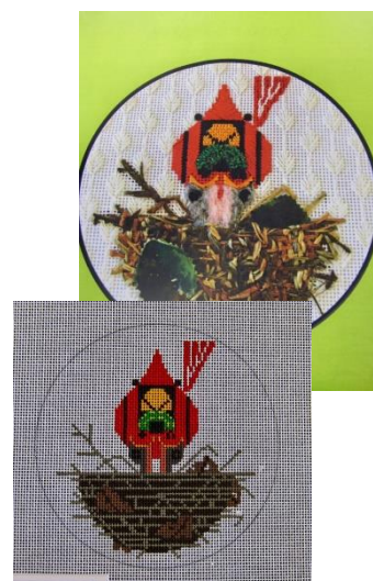
Cardinal Cradle Ornament $90

Charlie Harper canvas hand painted on 18 mesh by The Meredith Collection. Canvas size 13 x 20.