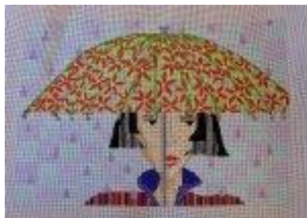
Rain Drops $13

Mindy's Needlepoint Designs. Hand-painted on 18 mesh. Total canvas size is 13 x 13.