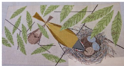
Vigilant Vireos $196

Hand painted on 18 mesh by Kirk & Bradley. Canvas size 12 x 12.