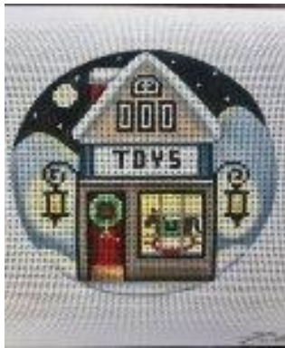
Toy Shop ornament $61

Rebecca Wood design handpainted on 18 mesh canvas. Total canvas size 8 x 8.