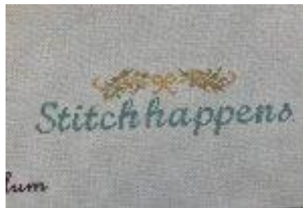
Red Bow and Stripes Heart $38

Rebecca Wood design handpainted on 18 mesh canvas. Total canvas size 8 x 8.