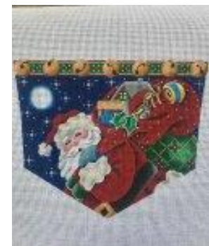
Santa's Toys Stocking Topper $185

Plum Stitchery design handpainted on 13 mesh canvas. Total canvas size 13 x 15.