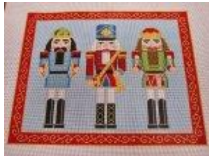
Nutcracker Trio $212

Plum Stitchery design handpainted on 18 mesh canvas. Total canvas size 13 x 14