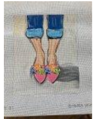
Pom Pom Shoes $169

Associated Talents Design. Hand-painted canvas on 18 mesh. Canvas size is 6 x 6.