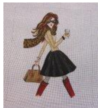
Fall Girl $102 Alice Peterson design handpainted on 18 mesh canvas. Total canvas size 13 x 15.