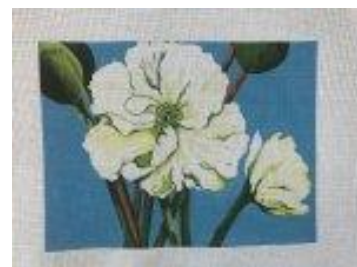
White Poppy Delight $200 Poppies hand painted on 18 mesh by Julie Mar. Canvas size 17 x 14.