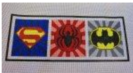
SuperHeros' Emblems $122 Alice Peterson Designs. Hand painted canvas on 13 mesh. Canvas size is 10 x 20.