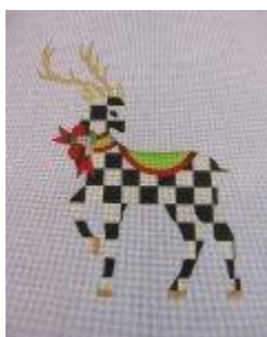
Standing checkered Reindeer $117 Raymond Crawford Designs. Hand-painted canvas on 18 mesh. Canvas size is 12 x 14.