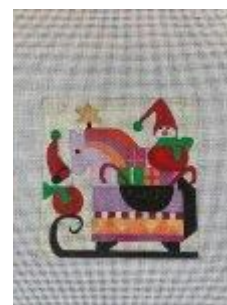
Wooden Horse Sled $54 Hand painted on 18 mesh by Melissa Prince. Canvas size 9 x 9.