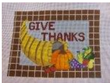
Give Thanks $83 JL Canvas Company Designs. Hand-painted canvas on 18 mesh. Stitch Guide included. Canvas size is 10 x 12.