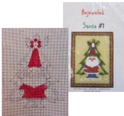
Bejeweled Santa with s.g. $63 Just Libby Designs. Handpainted on 18 mesh canvas. Total canvas size 10 x 12.