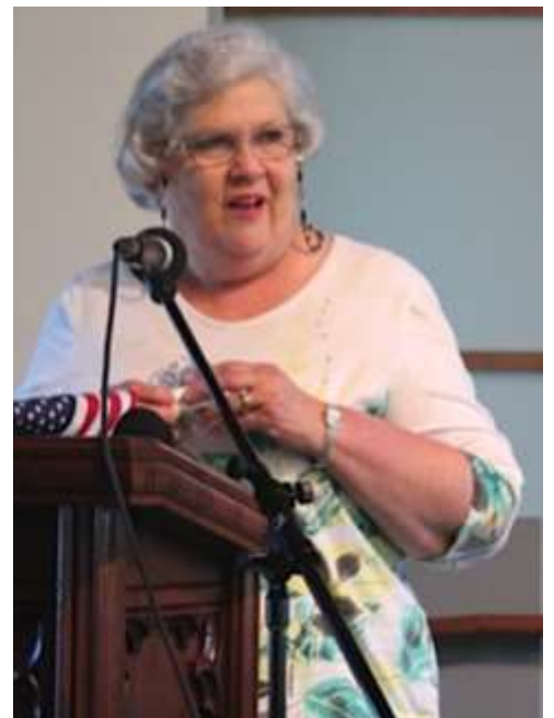
Silver Thimble Award recipient