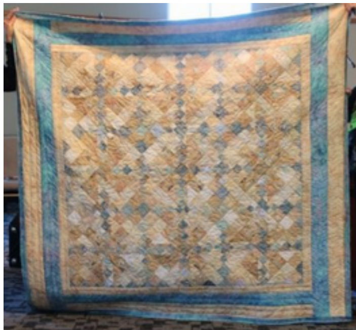
Kathleen Chauvin - Angotti Class

Show-n-Tell: many lovely quilts were shown, see pictures.