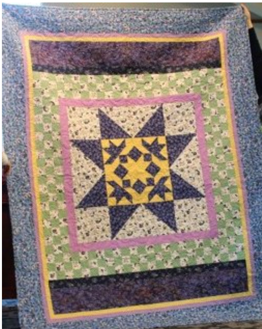
Dianne Latiolais - Star Shine

Quilts must be submitted to the Giving Quilt by March 22, 2013