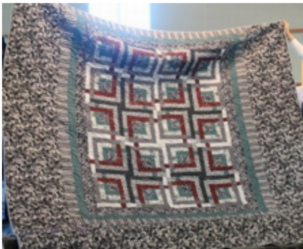
Georgia Courville - Modern Maze