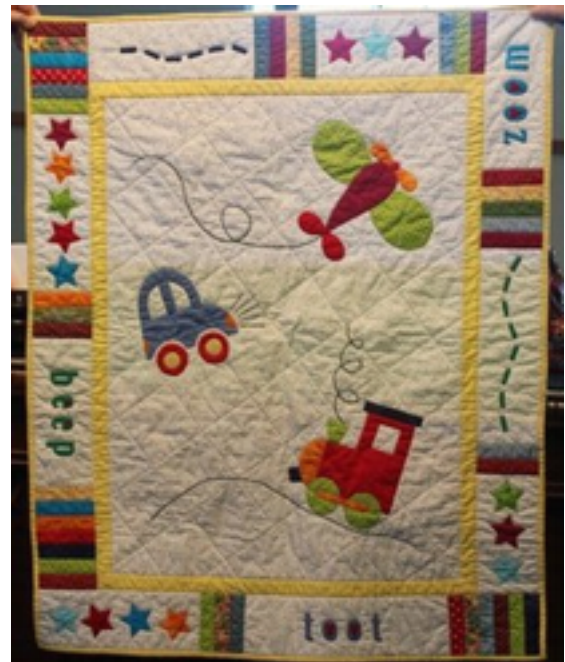
Phyllis Tabbert - The Giving Quilt