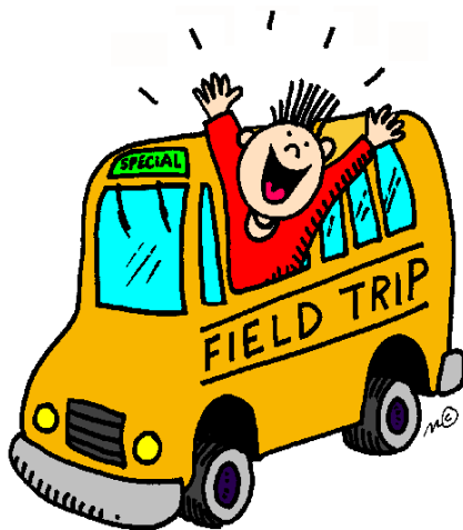
This Photo by Unknown Author is

non-breakable packaging such as canned food (tuna, beans, vegetables, tomatoes), boxed food (pasta, cereals), prepared foods (mac & cheese, Rice-a-Roni). Also needed are toiletries (toothpaste, soap, shampoo, deodorant, band aids), paper goods (toilet tissue, face tissues, paper towels) ... bring whatever you can to our April and May meetings.