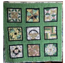
2004 sampler, the first quilt

Quilting became my obsessive go-to craft for therapeutic and gifting occasions, as well as refreshing home "décor." It can be quick or slow. No work space? The dining room table holds projects in myriad stages of construction. During this pandemic, the sewing machine stays plugged in, that dining table never gets cleared for company because... well... there is no company. Unused corners, bins, baskets, and assembled modular storage units house the stash and tools. On a 2008 trip to France, I bought Provençal fabrics to jump-start a souvenir gift to myself, which, after a 9-year hiatus deliberating over the borders, I finally completed...with scraps! Shopping online, I collect patterns and bookmark tutorials, create wish lists, and search for sales, short cuts, and design options. LIQS is the place for like-minded obsessions, camaraderie, education, and inspiration.