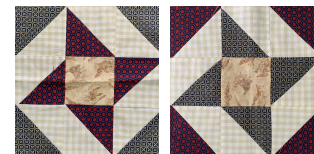
Samples of pieced blocks 2 layouts