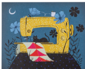
"Sewing Night" Art Print by Sarah Watts of Craftedmoon

https://media.rainpos.com/5241/LIQS_Charity_Projects_Instructions_wheelchair_pillowcase_port_pillow_.pdf