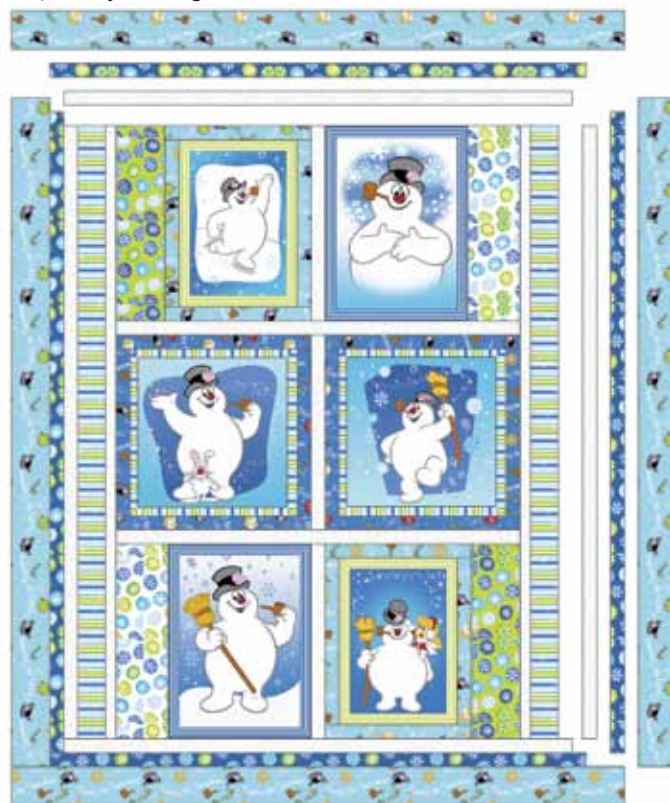
Quilt Layout Diagram