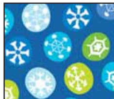
23959 Y (includes binding)