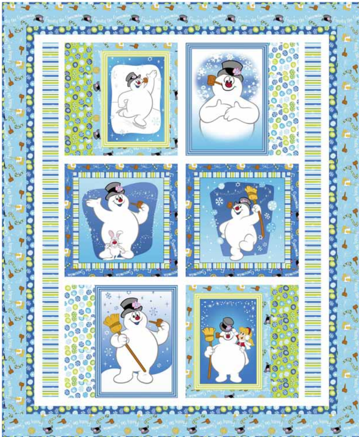
Approximate Quilt Size: 44½" x 54"