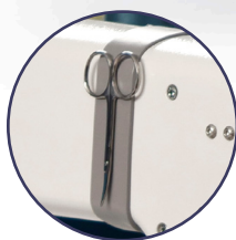
Magnetic tool minder collar