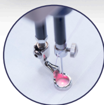
Pinpoint needle laser