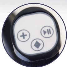
Independently adjustable handlebars with programmable buttons