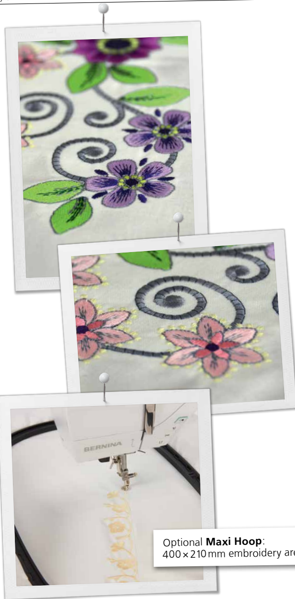
Optional Maxi Hoop : 400 x 210 mm embroidery area