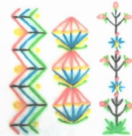
Sample of Stitches

Have you been wanting to learn more about wool embroidery? There are lots of beautiful projects out there! In November we are starting a new class series to introduce you to wool embroidery. You will learn about pattern transfer, basic and decorative stitches, and all about the materials/products involved in this fun hand stitching technique, all easy to complete, and for a minimal investment! Each month you will make a small project which later you can combine all together.