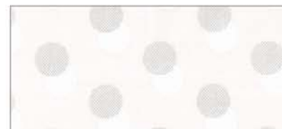
P4323 3S-White Silver