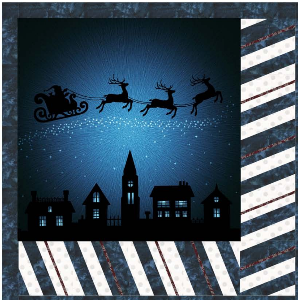
Candy Cane Border: 54" x 54"