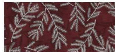
P7600 231S-Garnet Silver