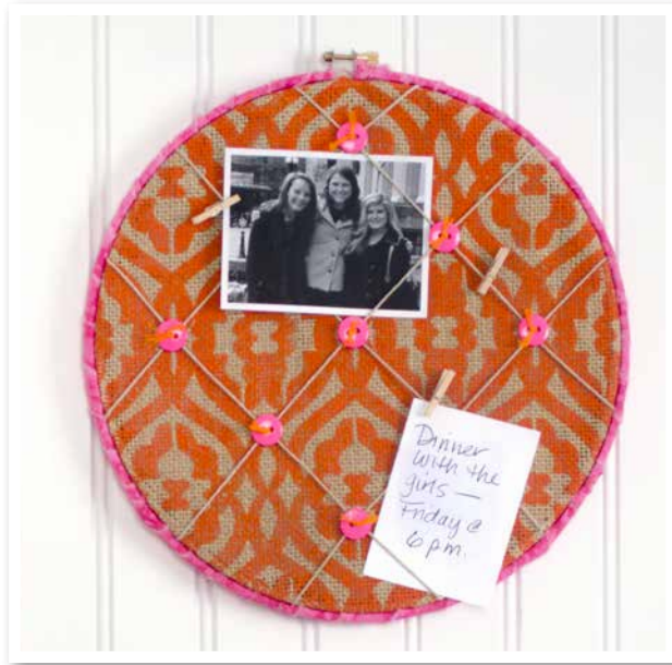
This textured memo board will stylishly organize your photos, notes, and other ephemera.