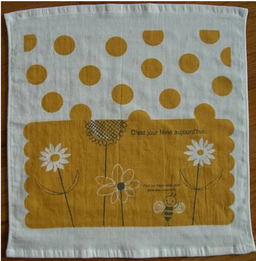
Shinzi Katoh Small Flower Towel