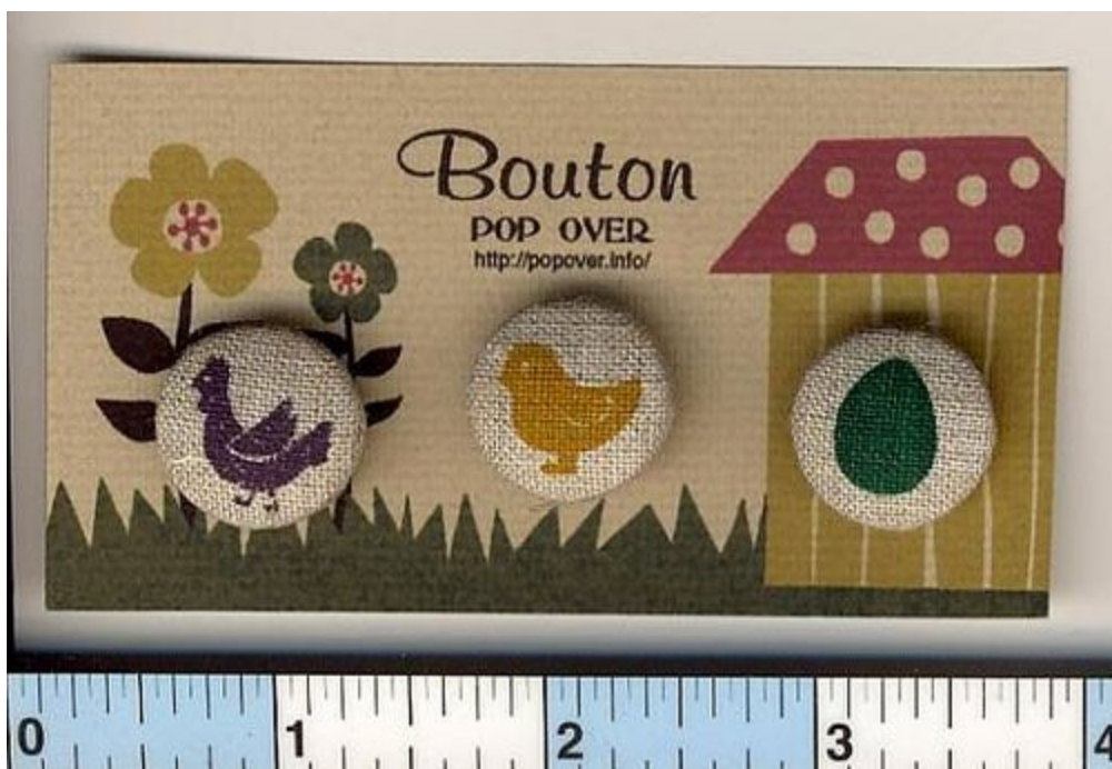
Just in: wonderful fabric-covered buttons by illustrator Shoko Sugiyama

mj: What gave you the idea to start superbuzzy.com ?