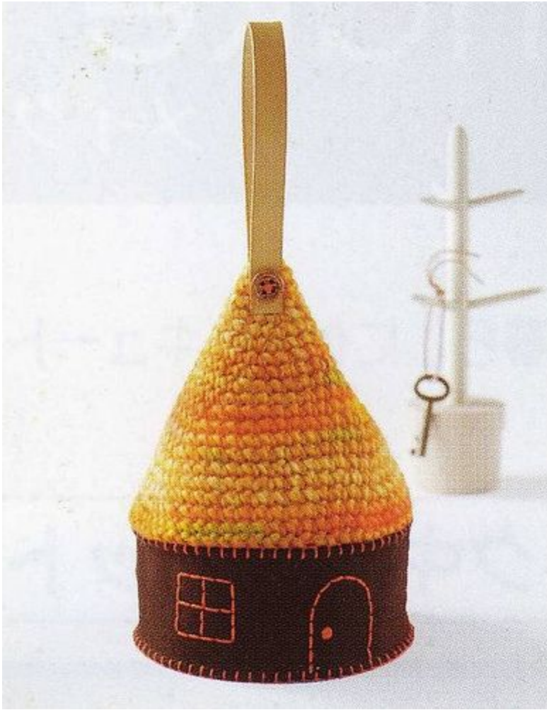
Make Me Happy Home crochet kit

mj: Do you have new products in the works?