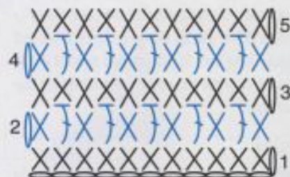
REDUCED SAMPLE OF FRONT PATTERN