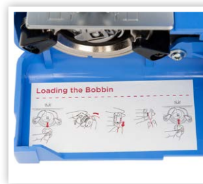
BOBBIN INSERTION GUIDE FOR EASY REFERENCE