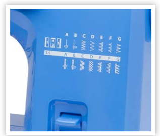
15 BUILT-IN STITCHES