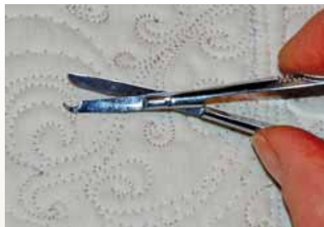
Famoré™ 4.5" EZ Snips™ with "hook" feature for picking out threads and snipping as well; although not a serrated blade on this model.