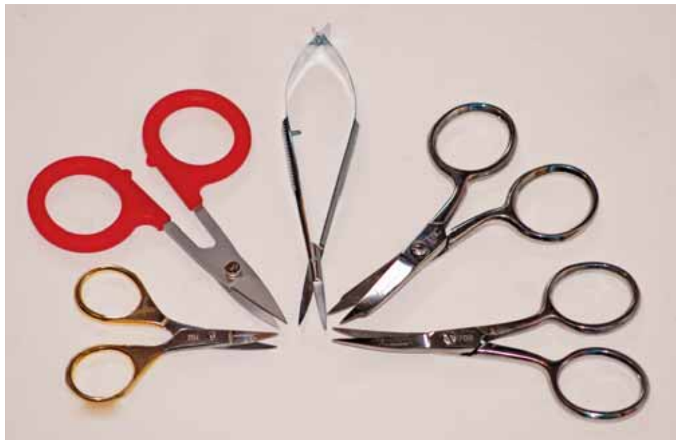
L to R Models: Famoré™ 2.5" mini-curved scissors, Karen Kay Buckley™ curved serrated red scissors, Famoré™ 4.5" curved serrated EZ Snips™, Famoré™ 4" micro tip curved scissors, Famoré™ 4" fine point curved scissors

If you've ever accidentally snipped into a quilt block, you won't wish to repeat that experience. Snips are a safety tool for you! Longarmers love them for the same reasons. It's nice to know you can get up close and personal without risk of injury to your precious projects.