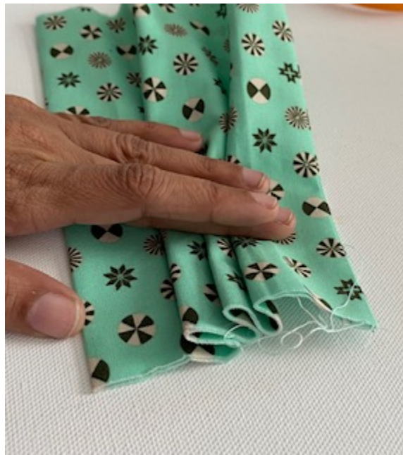
Step 3-Sew the sides straight down