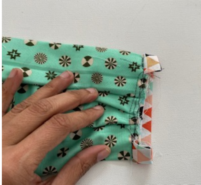
View of the back after you turn it over