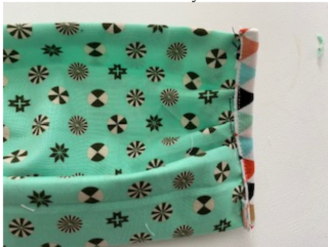
Finished back view