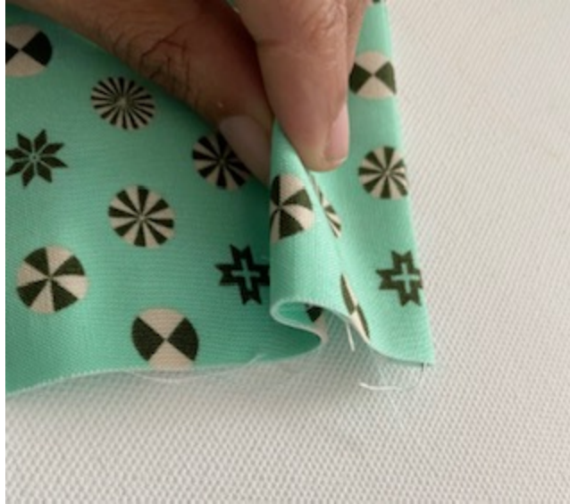
Step 2b-Form 3 pleats on each side. Pin down