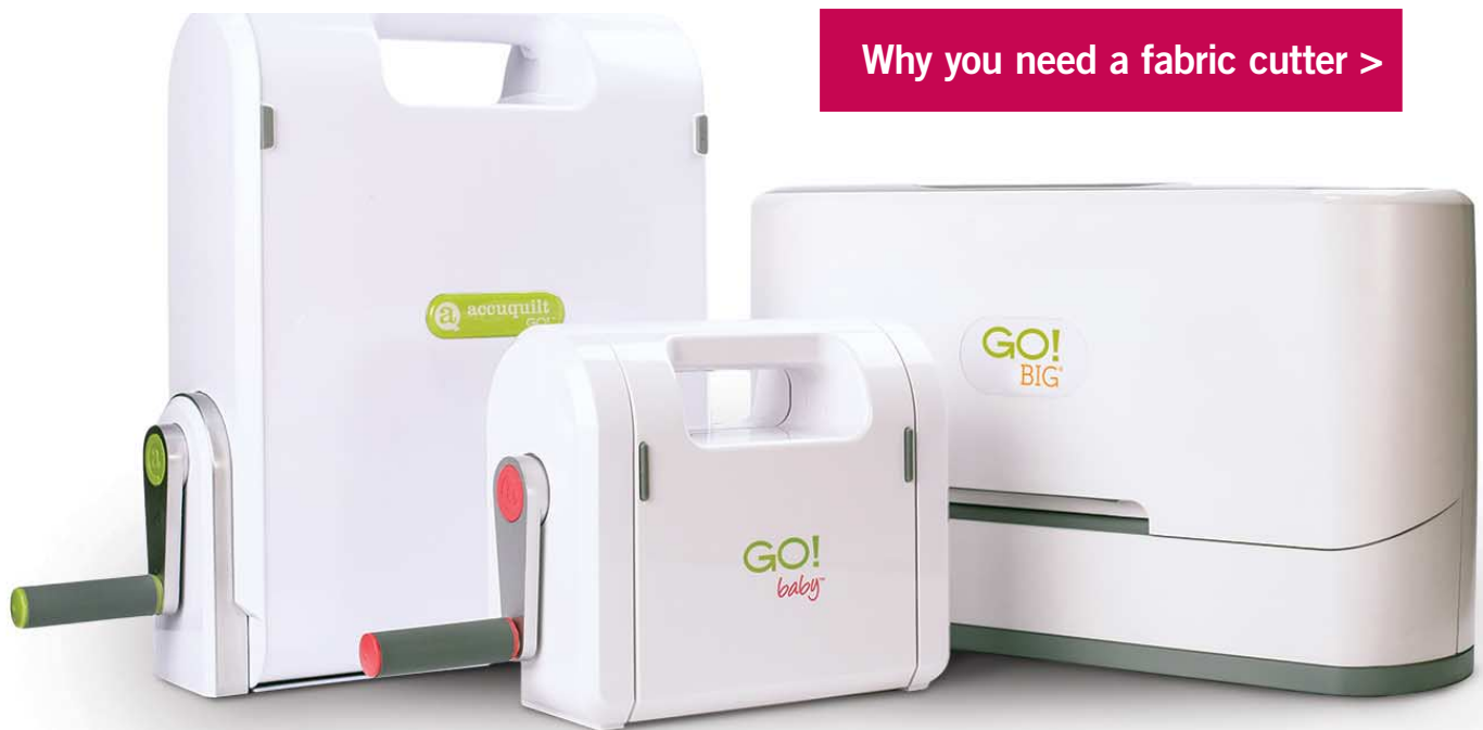
GO! FABRIC CUTTER