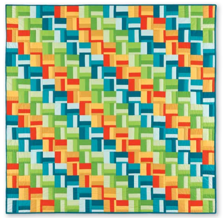
Fabric provided by RJR Fabrics.