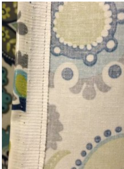
Turned under vertical sides.