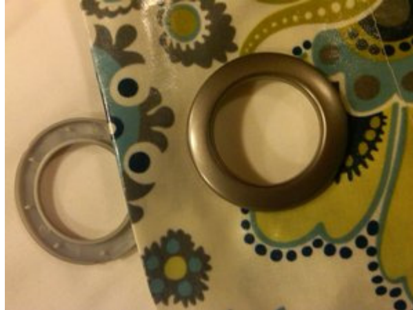
Positioning a grommet in the hole.

9. Place the front of the grommet into the hole. It should fit snug, but not pull or bunch the fabric. If that does happen, trim away a bit more of the fabric inside of the marked line. When it looks nice and smooth, snap on the back piece. It is so cool how easy grommets are to install!