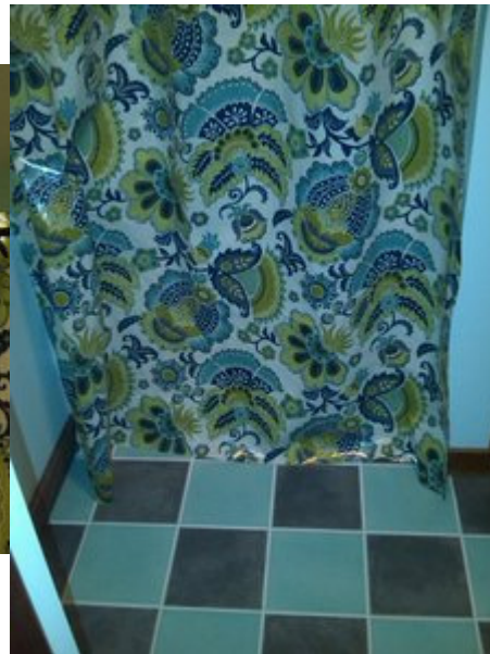
Check the hem length.

11. Admire your work. Doesn't your bathroom look great?