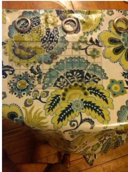
Position the grommets along the top edge and mark.

7. Find the center of the top of the shower curtain and mark it. You will need 4-6 grommets positioned relatively evenly to the right and to the left of the center mark. Give yourself 1" to 1 1/2" from each side before placing the first grommet. You also want them to be the same distance from the top folded edge--about an inch. Use a ruler for accuracy. Position the grommets along the top fold spacing them evenly, and mark the center and the top edge of each grommet. Doing one half and then the other half makes it easier. Take your time. You don't want to have to patch a big hole from a misplaced grommet.