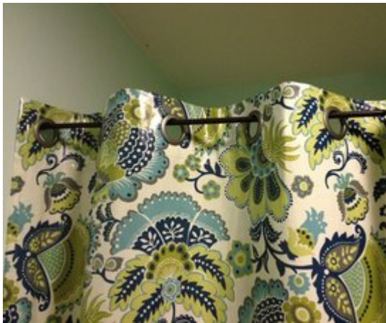
Thread the grommets through the curtain bar.

10. Thread the grommets through the shower bar and check the hem. Measure, turn under and top stitch.