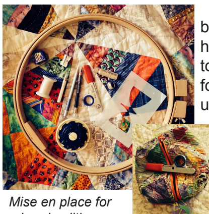
Mise en place for a hand quilting project: Hoop, Thread Heaven, thread, pencil sharpener, marking pencils, thread snips, extra needles, stencil, Clover Needle Dome that holds ten threaded needles. A pouch holds all the smaller things.

After choosing a pattern and gathering just the right fabrics from your stash or a trip to your favorite quilt shop, "mise en place" might mean setting up your sewing space with a new sharp blade in your rotary cutter, gathering the proper rulers & cutting mat, cleaning your sewing machine and installing a new needle, acquiring a comfortable chair and a clear work space, setting up a design wall, maybe even getting some chocolate or wine.