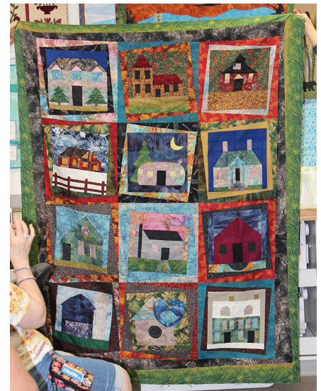
One of our first block-of-the-month quilts