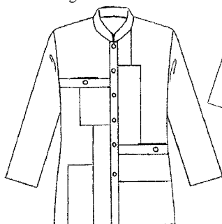
Long View – Front

SUGGESTED FABRICS: Medium weight cottons, linens, silks, lightweight wools. Rayon, polyester or silk lining. NOTIONS: Long View – Eight 1/2" or 3/4" buttons. Short View– Seven 1/2" or 3/4" buttons. Shoulder pads.