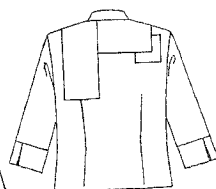
Short View – Back