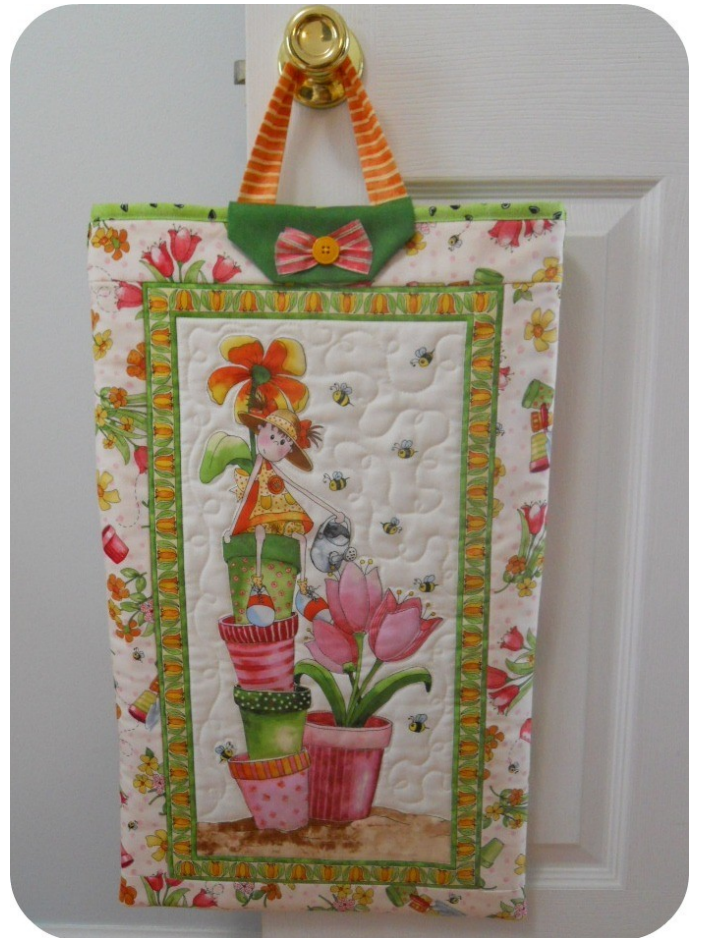
Sample made with Panel from 'Lil Miss Cutie Patootie Springtime Fabric from Red Rooster Fabrics