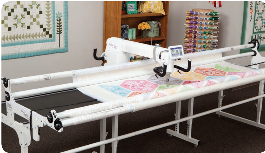
HQ Infinity footprint