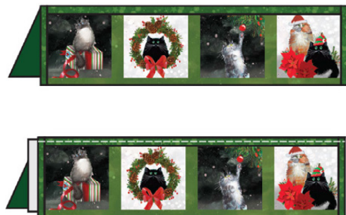
Pocket unit Make (6)

3. Lay the D 20" x 40" rectangle flat on work surface. Position the first pocket unit along the bottom edge, with raw edges matching. Baste 1/8" from bottom edge and 1/8" from side edges to hold bottom pocket in place.