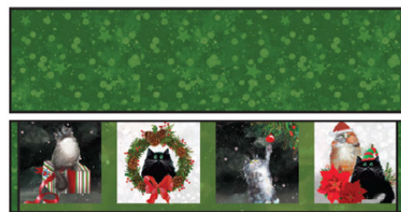
A-C unit Make (6)

2. Fold A-C unit in half so raw edges match along bottom long edge, creating a green C strip above the A strip, and press. Tuck (1) 20" x 5" fusible interfacing strip inside and fuse to adhere to make (1) pocket unit. Topstitch along green strip at top. Make (6).