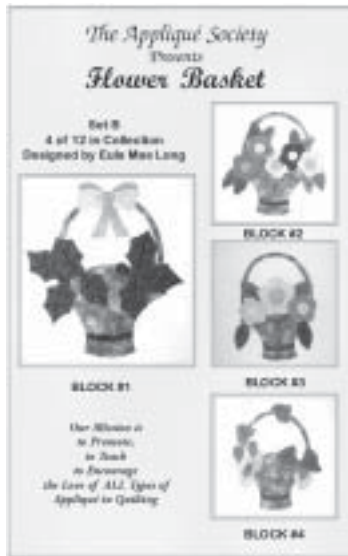
Pattern Pack B