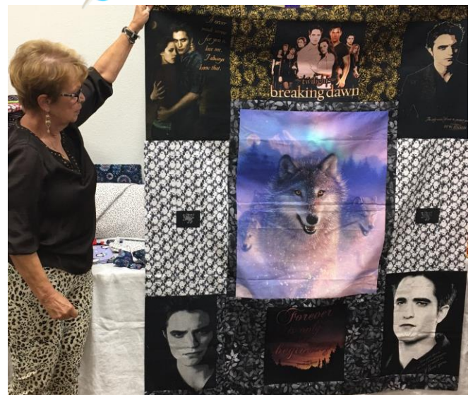
Dana Gleghorn's granddaughter's "Twilight" Tee Shirt Quilt