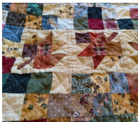
PhD – Elaine Snyder Beautiful hand quilting