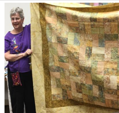
Fay Poudrier's Light Batiks