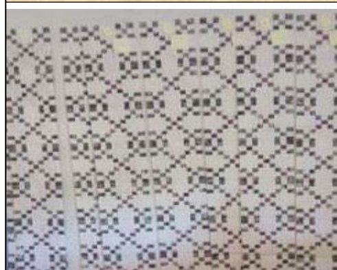
Dream Project – Lyn Hawkes All the rows come together