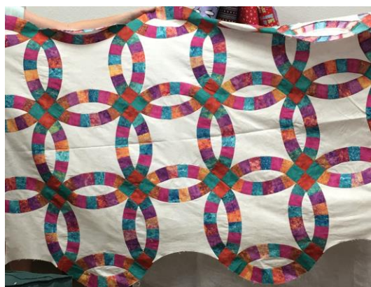
Terri Summers Double Wedding Ring