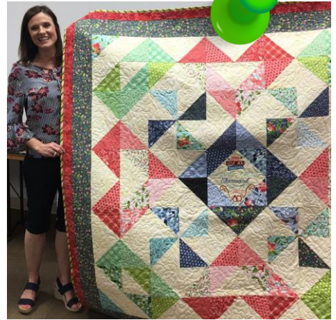
Kristi Porter with 2 wedding quilts for June