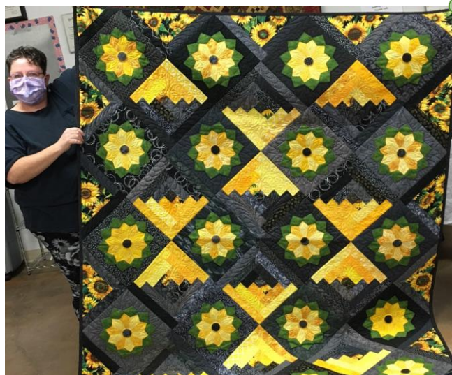
PhD – Paco Rich Sunflowers at the Cabin