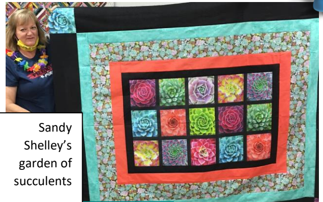
Sandy Shelley's garden of succulents