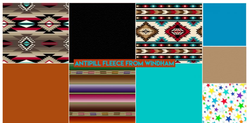
Windham's Antipill Fleece in wonderful Southwestern patterns and colors.