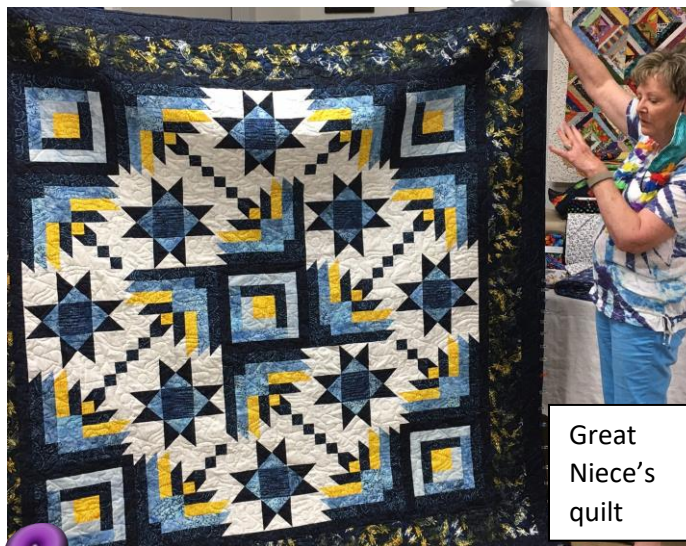
Great Niece's quilt