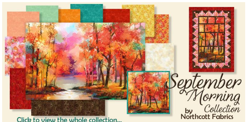
Northcott Fabrics' September Morning collection.