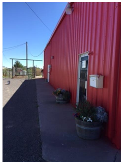
And a new coat of paint for the Attic

Don't miss the Women's Fiber Arts Collective Holiday Fiber Arts Sale November 26 th 10 – 4 at the Silver City Women's Club.