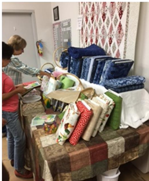
New fabric lines on display at Terrific Tuesday

Thanksgiving Greetings To Everyone! Well, it is again that time of the year when we give special Thanks for all the many blessings we have in our lives. When I think of the Pilgrims that came to this country and all the generations after them, I am especially thankful for the many modern conveniences that make our lives much easier. I am thankful for the beauty that exists in this world, both in nature and in the people who I have contact and association with. I am thankful for my heritage that allows me to live where I do, in this wonderful free country, and especially in the fantastic Southwest. But most of all I am thankful for my family and wonderful friends that have blessed my life so very much. I hope that each and every one of you have a fantastic month and that you eat a little too much, and thank a Veteran who helped to make us free. Live life to its fullest and be happy, and, of course, QUILT!