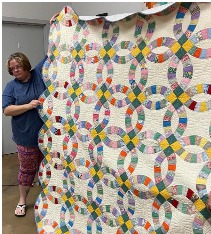
Somewhat this old Wedding Ring quilt top found its way to Paco Rich's longarm. It is so nice to preserve these old quilts.